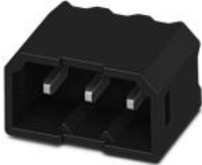
Header, Nominal current: 6 A, Number of positions: 7, Pitch: 2.5 mm, Color: black, Contact surface: Tin, Assembly: SMD/THT/THR

Please be informed that the data shown in this PDF Document is generated from our Online Catalog. Please find the complete data in the user's documentation. Our General Terms of Use for Downloads are valid ( http://phoenixcontact.com/download )