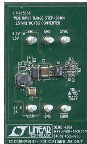
Figure 1... Quick Start connections for DC436A.